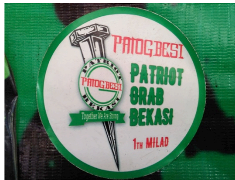
FIGURE 7: VARIOUS EXPRESSIONS OF COMMUNITY IDENTITY IN APP MOTORCYCLE PANGKALAN LOGOS

In addition, a pangkalan always has a leader; the leader is often called coordinator, implying a nonhierarchical, horizontal feeling of these communities. According to app motorcycle pangkalan drivers, there are three criteria that make a good coordinator. The criteria are: seniority, experience, and indigenusness.