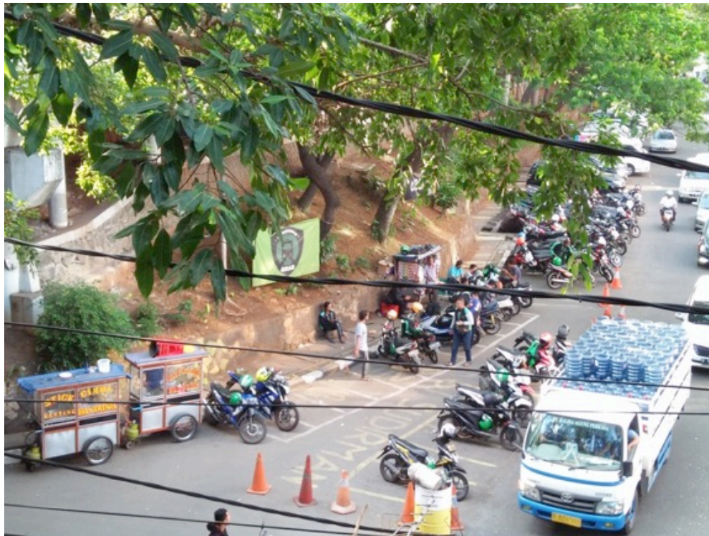
FIGURE 9: A SPATIAL EXAMPLE OF URBAN INFORMALITY AS "COPRODUCED PUBLIC GOOD"

Might it be that the variations in informal sectors reflect no more than accidental differences in the limits of formal government services? Or, could it be that the degree of informality, availability of informal services, and similar outcomes reflect a certain decision or intention on the part of stakeholders (including state actors) connected with each other in a pattern of informal governance? The interview responses from this research bring me to interpretations in the direction of the latter. Informal transport in the streets of Jakarta apparently reflect the contributions of multiple, different stakeholders – and even the new app mobility services share this hybrid nature. The picture that emerges, then, is that urban informality, at least some variants, may be thought of as coproduced public good.