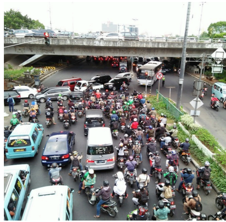
FIGURE 3: SATURATED ROAD TRAFFIC IN CENTRAL JAKARTA

Jakarta citizens also tend to spend long hours on the road, due to limited mass transit (therefore more road traffic), and poor service quality of public transportation in general. In the past, it has been suggested that citizens experience transport more as suffering than service – a situation that continues, even as national and provincial governments are making significant investments for expanding the TransJakarta BRT system (DKI Jakarta), and MRT and LRT systems scheduled to open in the next few years (national government). For now, traffic jams in Greater Jakarta cost around USD 5 billion in economic losses annually, according to estimates by Indonesia Ministry of