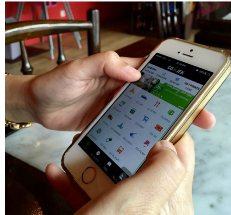
FIGURE 2: APPS OFFER A VARIETY OF ON-DEMAND MOBILITY, E-PAYMENT AND ADDITIONAL SERVICES IN INDONESIA.