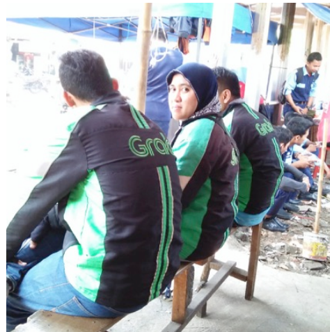
FIGURE 6: SOME APP MOTORCYCLE DRIVERS ARE WOMEN

In terms of membership, the drivers' communities are inclusive groups and the standards for joining are to be working in the job, to follow the rules or norms of doing that job in the area, including queuing norms, and, more often than not, to make small weekly contributions to a communal saving. In my interviews, the size of a pangkalan and pangkalan -like drivers' ranges from five to around 70; most frequently they were 20-40, and a pangkalan with more than 50 members may be considered large.