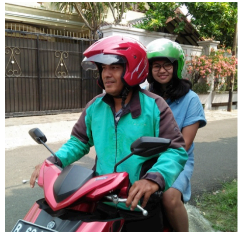
FIGURE 1: APP MOTORCYCLE TAXI, OR "ONLINE OJEK"