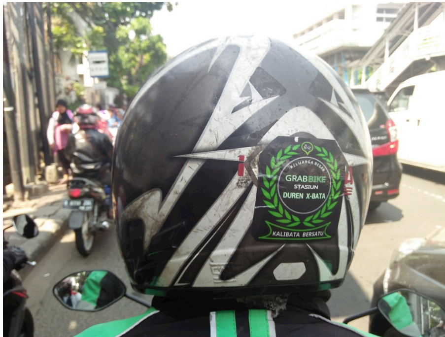
FIGURE 5: A LOGO OF APP MOTORCYCLE COMMUNITY SPELLS "BIG FAMILY," "UNITY"